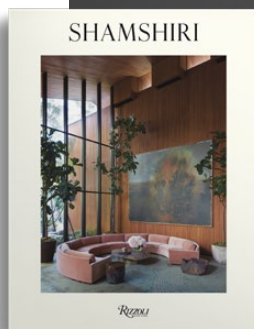
FROM LEFT: Shamsiri: Interiors ; a Shamsiri-designed home on the Amalfi Coast

Under the direction of Pamela Shamsiri, Studio Shamsiri has garnered a loyal following among design-savvy celebrities, creative entrepreneurs and aficionados of high design across the globe. Shamsiri: Interiors (Rizzoli) offers a master class in design through the firm's signature sensibility for creating extraordinary spaces alive with color, texture and beauty. From restrained modern interiors to sumptuous fantasies, each project in this lavishly illustrated volume represents a unique, self-contained world of imagination and inspiration.